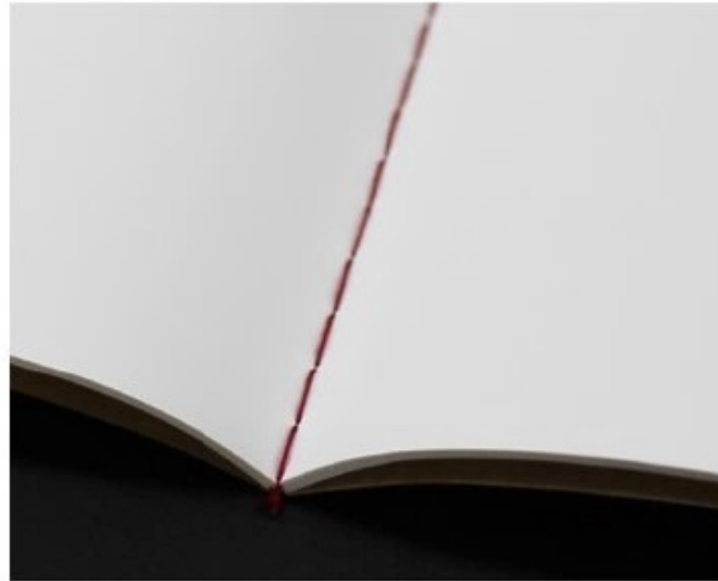
Thread color is Red for plain ruling