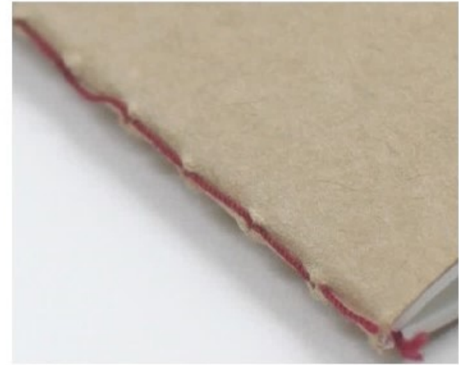
Thread is lightly glued not to loose