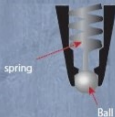
Inside of the ball tip

For the ball-point pens with low viscosity ink, precision ball tips are definitely required. Otherwise, ink can be leaked easily and it could cause serious problems. All Anterique's ball-point pens are equipped with super precision "spring tip," which control the perfect ink flow and prevent from ink leakage.